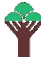
Sarawak Forestry Department, Malaysia